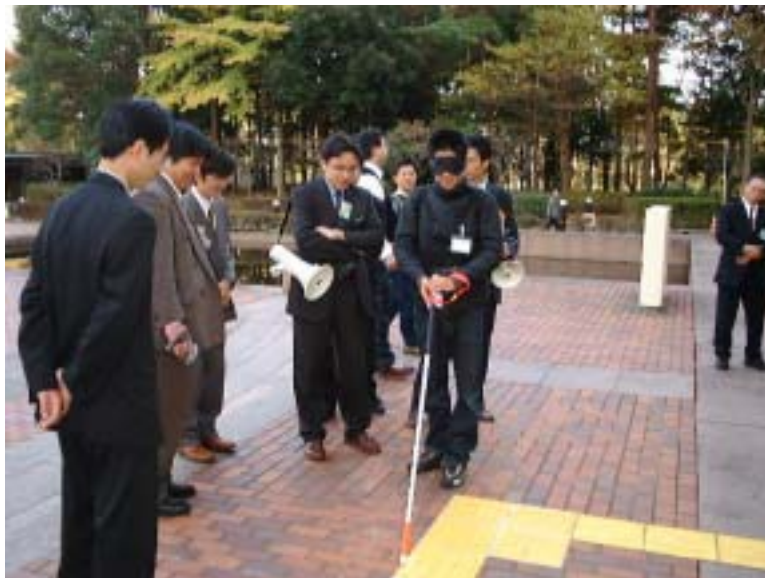
Photo 4 Demonstration of pedestrian ITS at NILIM

As a new trend of the pedestrian walking aid technique, the new system using the information technology is developing at National Institute for Land and Infrastructure Management (NILIM) in Japan. Many electrical equipment manufacturers in Japan are participating in this project named Pedestrian Intelligent Transport Systems. The aim of this project is offering more exact position information and guidance information than present condition to the pedestrian of a disabled person, elderly people, and an ordinarily person using information technology. Photo 4 showed the demonstration of pedestrian ITS at NILIM. The result is expected as a new system by which this research combined each component engineering. However, in order to spread this system, it is clear that great expense is required, and if an individual does not purchase the apparatus, it cannot use.